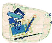
Improved classification of materials: orange – organic, blue – metals, green – mixed materials