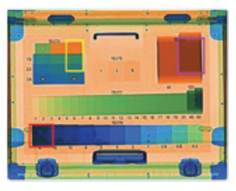
Automatic detection of explosives / drugs and alerts