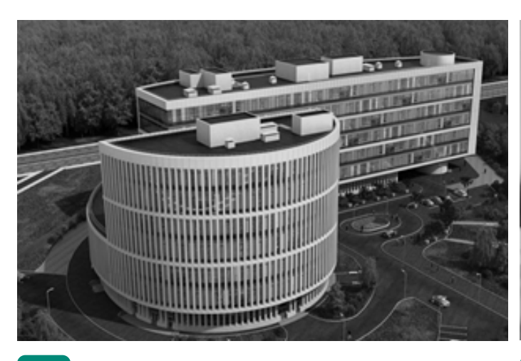
STATE AND MUNICIPAL INSTITUTIONS