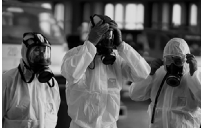
02 MEDICAL FACILITIES