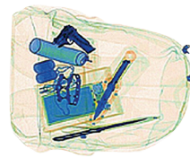
Improved classification of materials: orange – organic, blue – metals, green – mixed materials