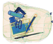
Improved classification of materials: orange – organic, blue – metals, green – mixed materials.