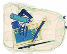
Improved classification of materials: orange – organic, blue – metals, green – mixed materials